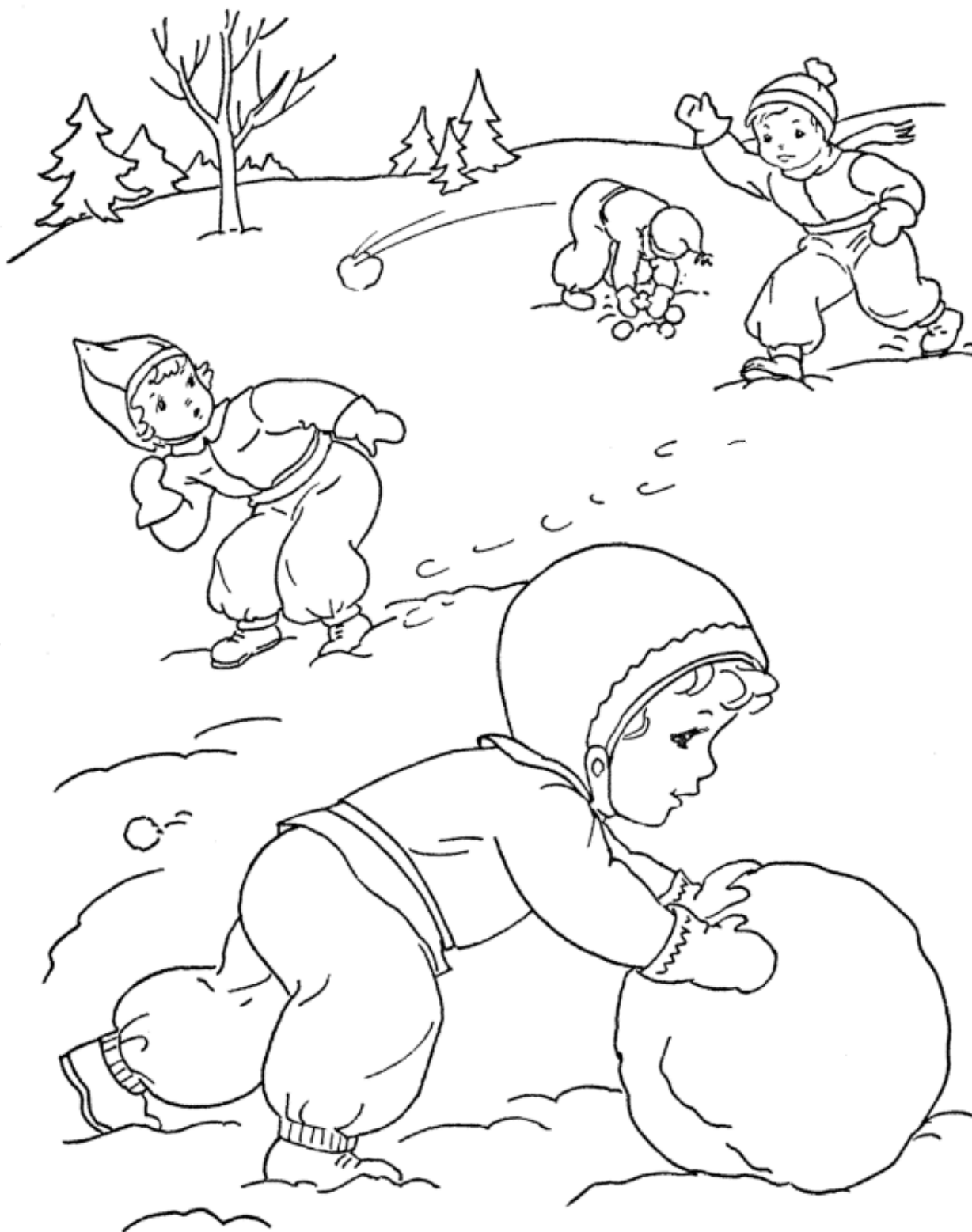
Betty rolls a big snowball.