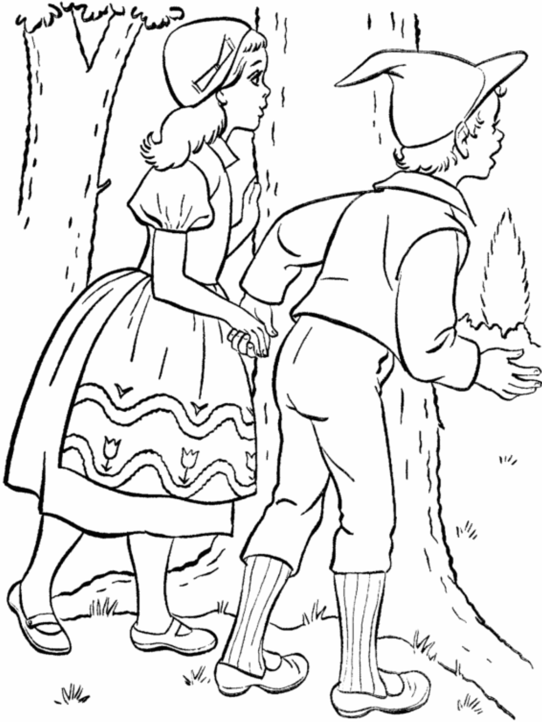
HANSEL AND GRETEL